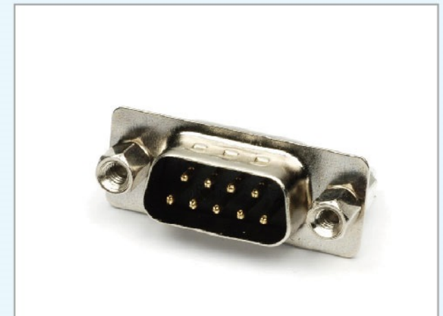
Gaming and Consoles