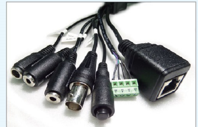
Security and Defence