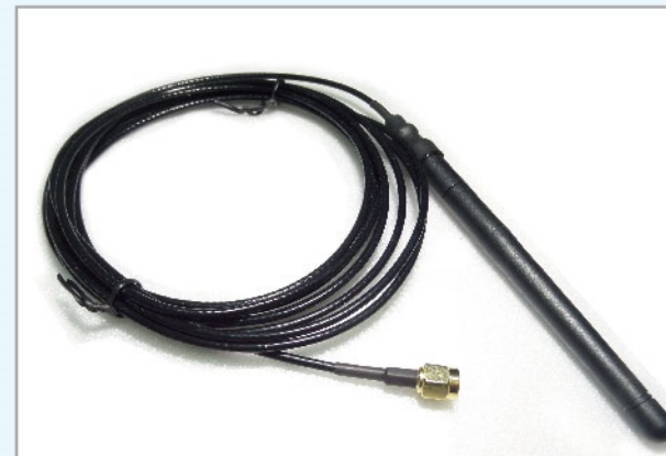
Technology & Communications